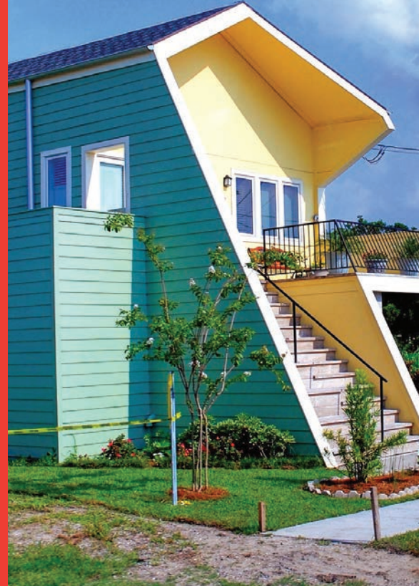
Lower Ninth Ward