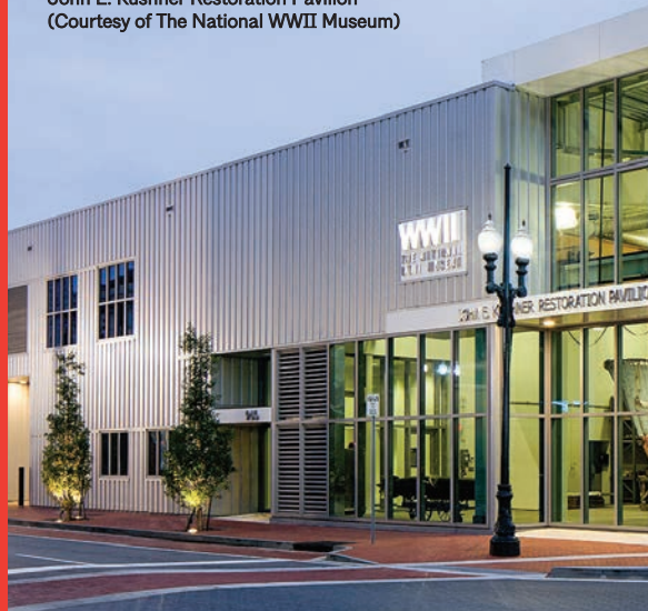
John E. Kushner Restoration Pavilion