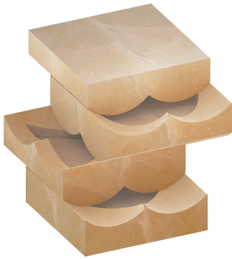
Rendering of "01 Tiffin" by LEONG LEONG

Works by LEONG LEONG, LEVENBETTS and STEVEN HOLL ARCHITECTS