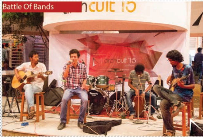
Battle Of Bands