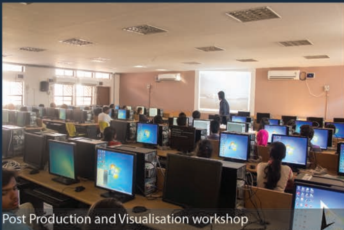
Post Production and Visualisation workshop