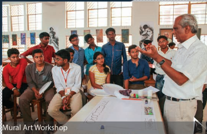
Mural Art Workshop