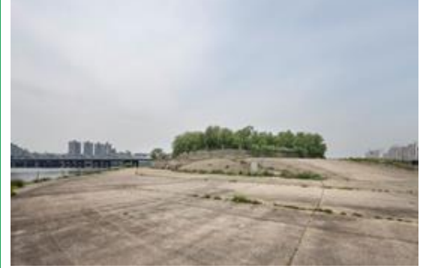
Nodeul IsaInd_