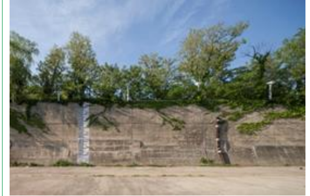
Nodeul IsaInd_