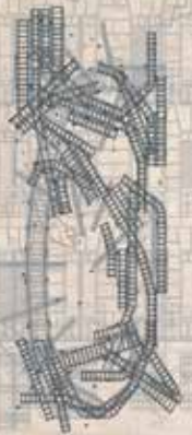
DOMES CONSTRUCTION PLAN