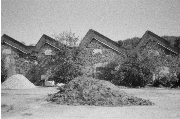
Angela Ka Ki Lee / Studio HAAU + Roberto dell'Orco, La boucle du temps, 2020

sustainable aesthetic practices in dialogue with consumption, waste, and collective memory.