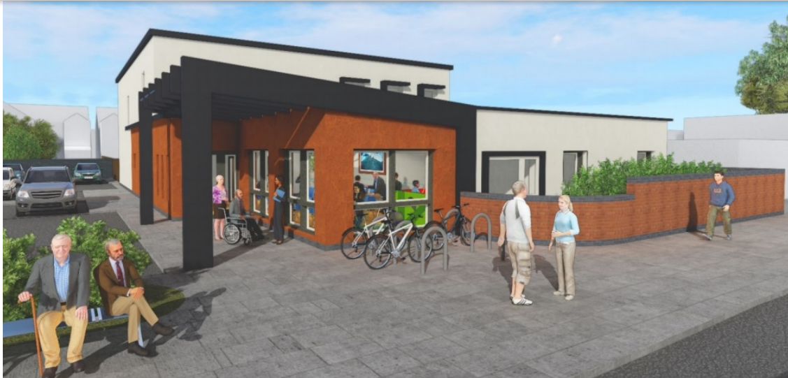
FOLESHILL HEALTH CENTRE