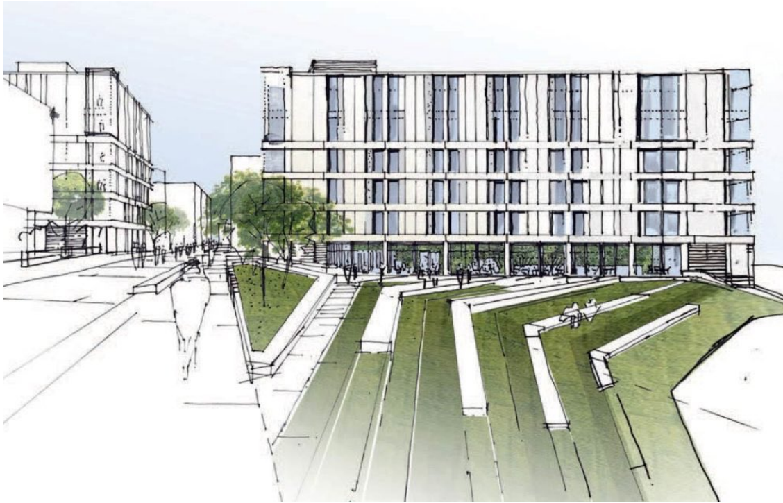
UWE STUDENT RESIDENCES