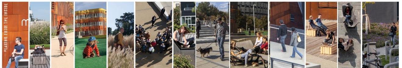
URBAN MENUS methodology – Reference URBAN MENUS India including Impact Analysis – Reference Campus WU