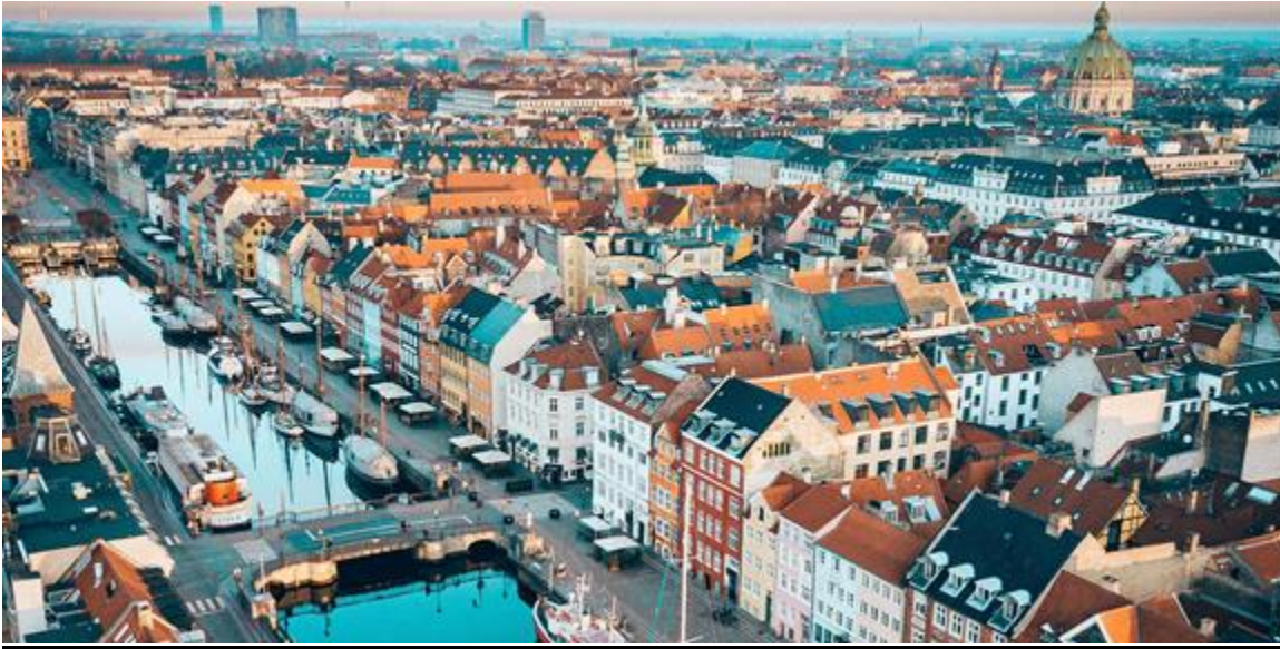
Fig: 4 – Aerial View of Copenhagen's urban architecture

The secret of Copenhagen is open for the world to discover, and 2023 marks this special moment that has a chance to open it for the rest of the world. The competition brief here is to design an Athenaeum for Architecture at Copenhagen, that resonates with the evolving trends of world architecture. The word “Athenaeum” in the 21 st century should be more than just a space for learning about architecture.