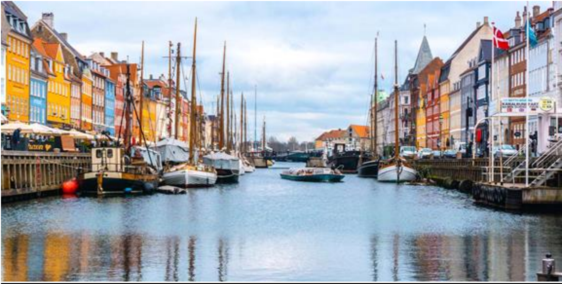
Fig: 1 – A view of the Copenhagen Port

Architects are not endowed with designing just buildings but with time, we are now building economies and megacities. This expanded role of architecture is becoming more and more evident with the passing century, where the profession found itself from making enclosures for functions to defining how the functions would be. The keywords to define the architecture, transformed from just Aesthetics and Order, to Efficient and Sustainable. And it's continuing to change.