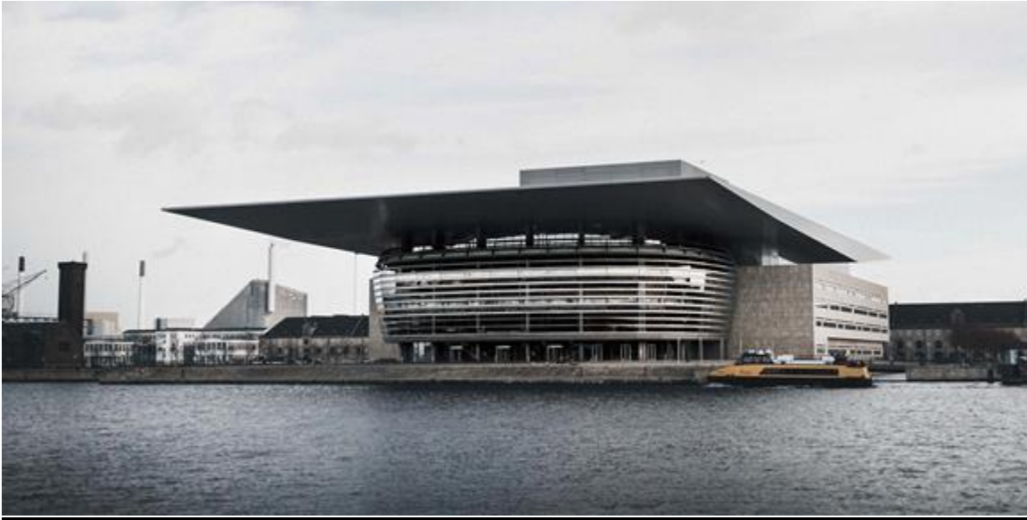
Fig: 3 – The Copenhagen Opera House - A global standard for Opera venues around the world.

While it's true that such iconic structures make places memorable, the capital of Denmark - Copenhagen - balances ties to the past and futuristic architectural marvels almost flawlessly. The city boasts of various venues of international stature and architecture pieces that fit in the book's most revered examples of modern built heritage. The city contributes a very people and outdoor-friendly experience - and aims high towards achieving carbon neutral status by 2025.