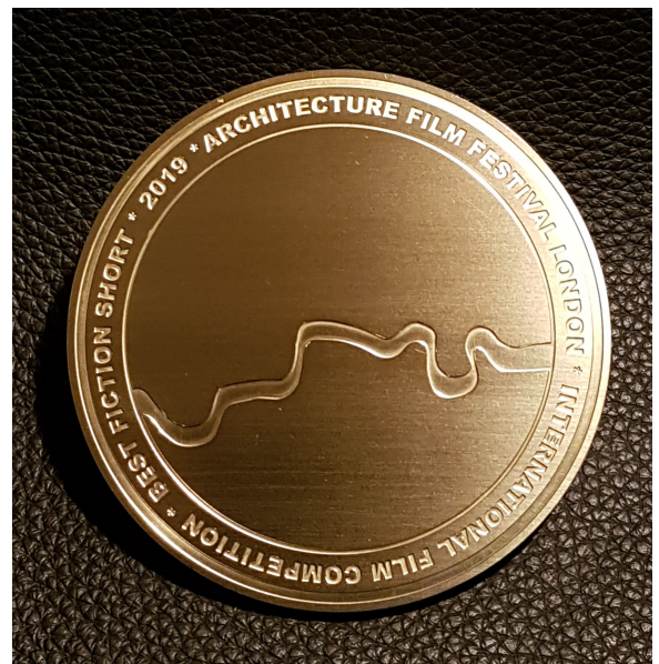
Architecture Film Festival 2019 Award Piece - Best Fiction Film Category Award Shown

London, UK, 01.02.2021 Architecture Film Festival London