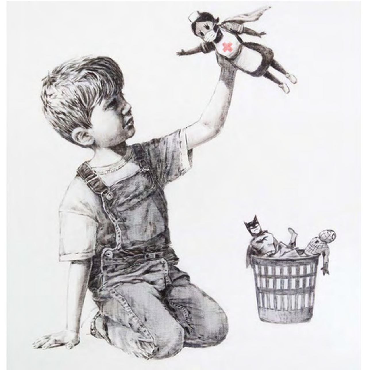
A painting by Banksy

Contemplate how we will come together or stay apart in the upcoming period. The solution does not have to be grandiose or even architectural, it can be basic and take any space or form that your community entails. The intervention should be emotional, powerful, poetic and can take any form/function as per the participant's narrative. The memorial should take shape in an area footprint that can range from a minimum of 100 sq. meters to a maximum 1000 sq. meters.